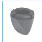
P525956 Vacuator™ Valve 1"