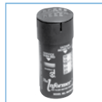
X002277 & X002278 Filter Service Indicator The Informer™ 20" & 25" Limit