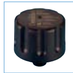
P564669 T.R.A.P.™ Hydraulic Reservoir Breather 1" NPT