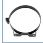
P007191 Air Cleaner Mounting Band 6.5" I.D.